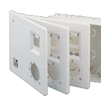
KIT SCB (TRASF.E.C.) Code 22481