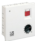
SCNRB SCAT.COM.NON REV.INCASSO Code 12971